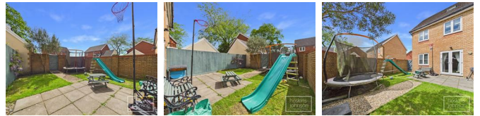
Small open plan lawned front garden. South East facing, level garden with paved patio, lawn and gated access to parking and garage.