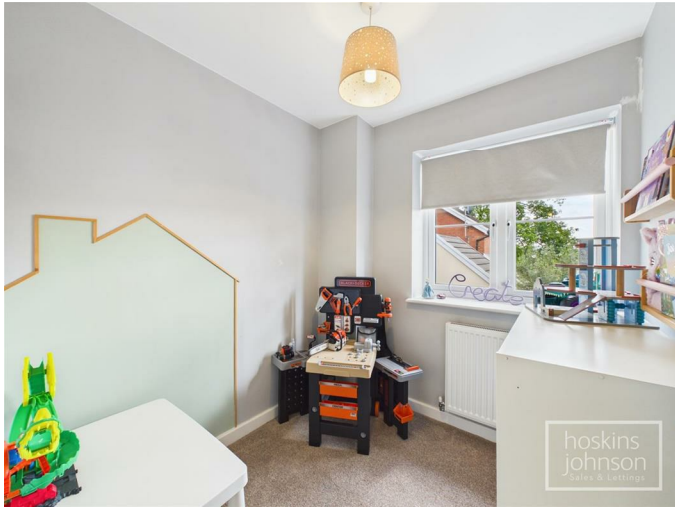
Double glazed window to rear, radiator.