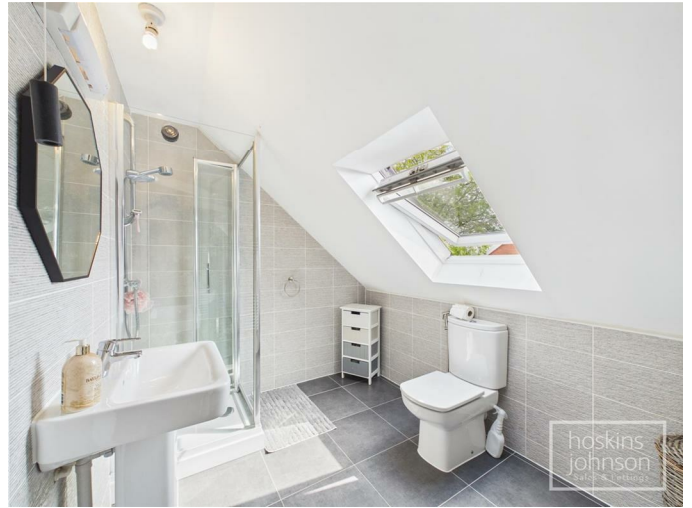
Tiled mains shower cubicle, wc, wash hand basin, tiled walls and floor, chrome heated towel rail, skylight to rear.