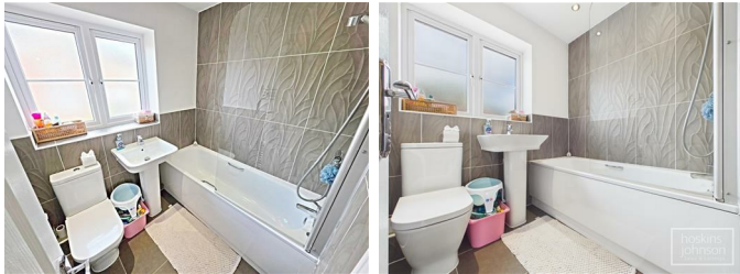
Modern three piece suite in white comprising panelled bath with mains shower, wc, wash hand basin, part tiled walls, tiled floor, chrome heated towel rail, ceiling spotlights, double glazed window to front.