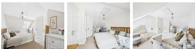
Double glazed window to front, radiator, built in double wardrobe.